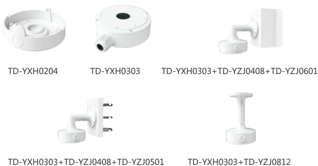
TD-YXH0204 TD-YXH0303 TD-YXH0303+TD-YZJ0408+TD-YZJ0601